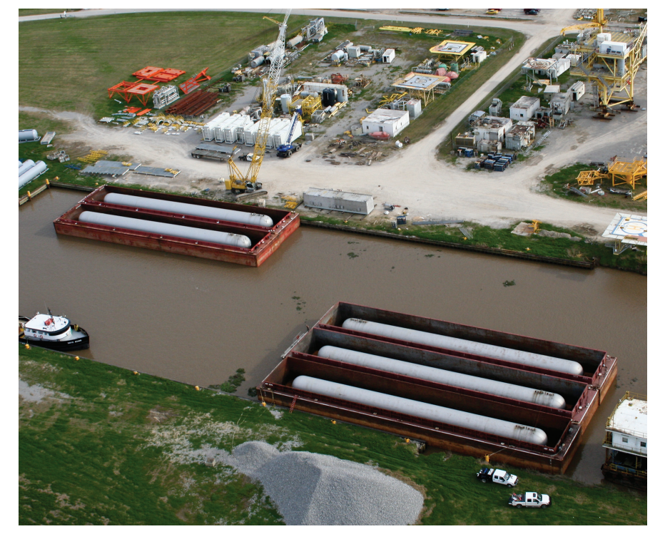
Reprinted from Butane-Propane News December 2013